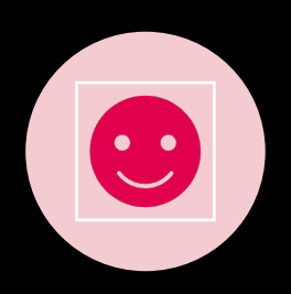
IT FEELS POSITIVE / ACTIVE